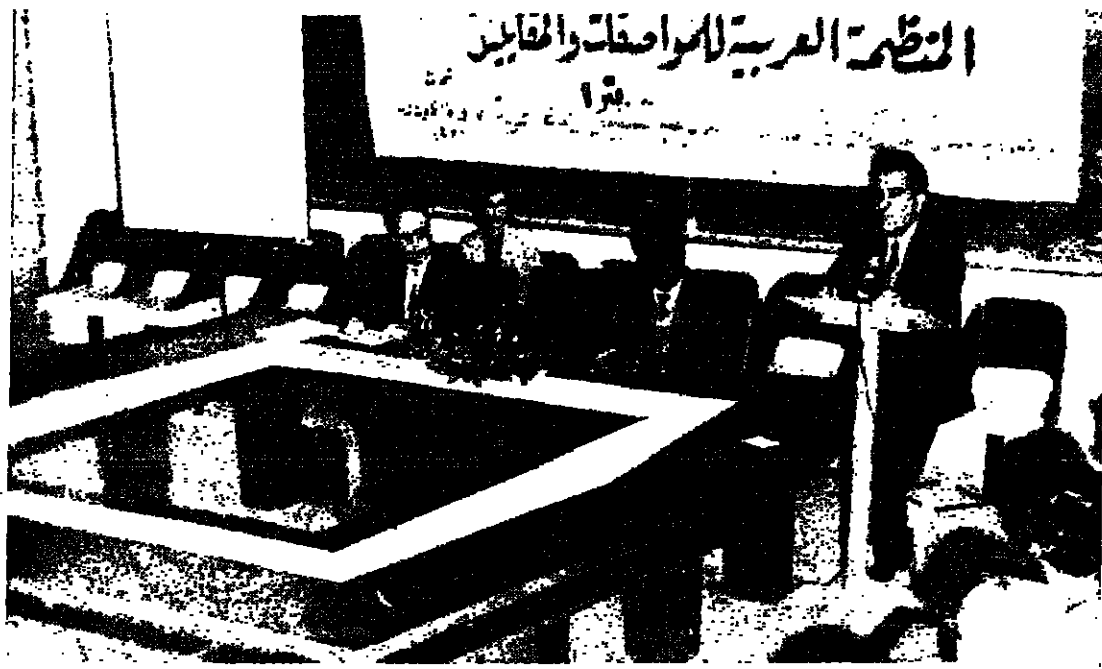
Opening session of the Arab standardisation and quality control course at the University of Jordan Monday